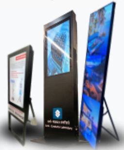
DIGITAL SIGNAGE STANDEE