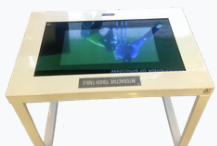
Digital Touch Table