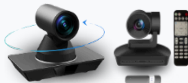
VIDEO CONFERENCING CAMERA